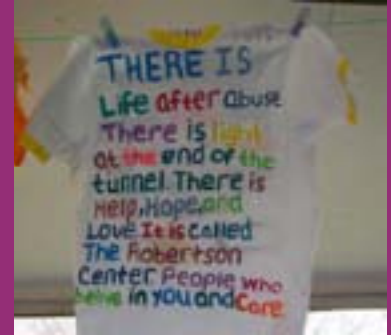
T-Shirt from the "Clothesline Project"

Bridgeway's Terry L. Robertson Center is the only emergency safe shelter and outreach support program in Lincoln County. It offers many services, including a 24-hour crisis hotline, counseling, advocacy, children's services and emergency shelter.